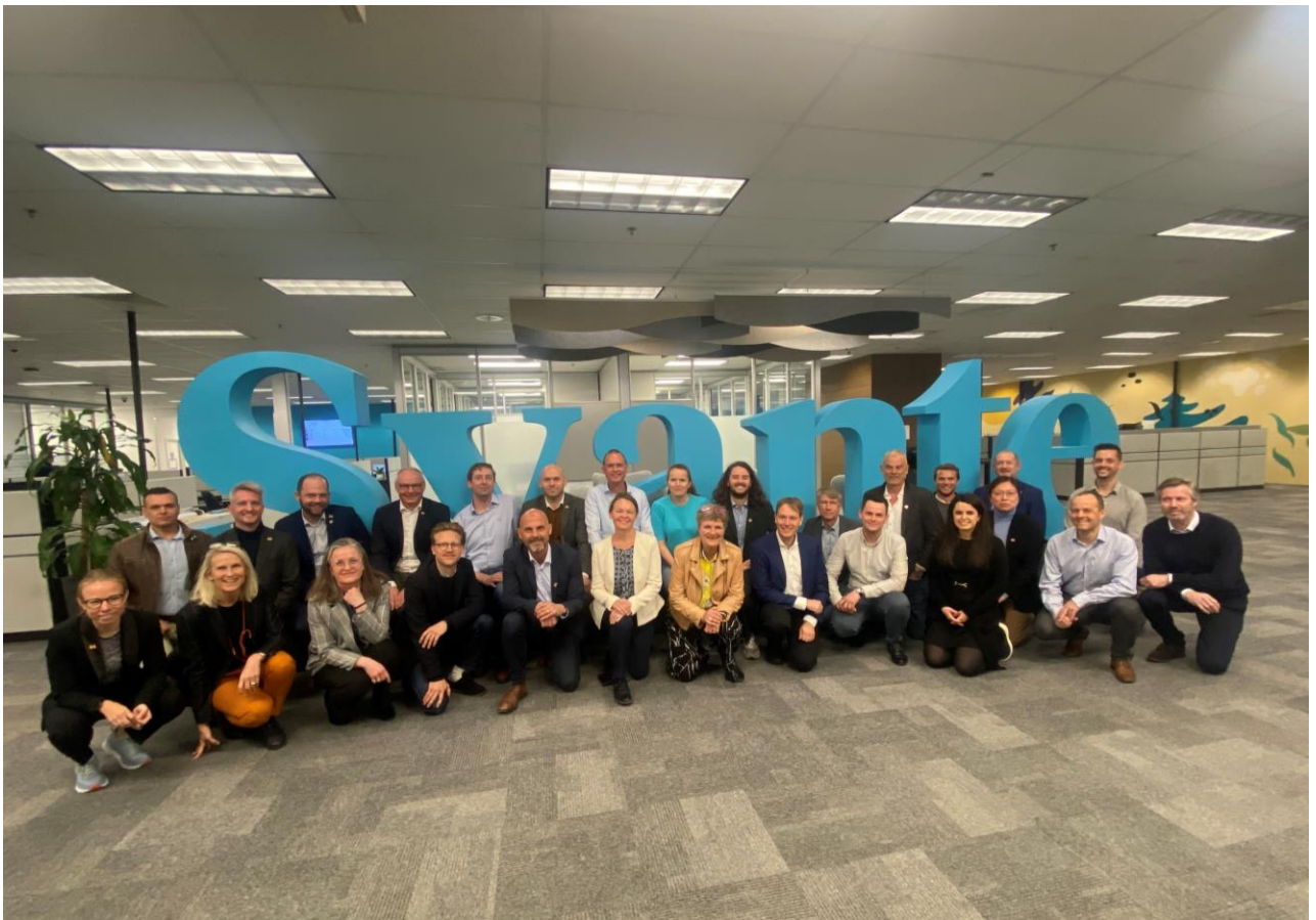
Visiting Svante

The delegation also visited Svante and got to see the MOF Technology Advancements' prototype which is being built to capture around 180,000 tons of CO 2 pr. year. Svante is actively working towards the commercialization of MOF technology, a technology which in Denmark is currently at a low developmental stage. Looking ahead, Svante aims to scale up significantly, with the capacity to deliver two capture units per week by the year 2030. The absence of amines further contributes to limited environmental challenges associated with operating the technology - as there are apparently