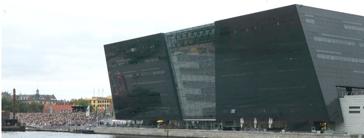
View of "The Black Diamond", the Royal Danish Library

ATV is a member of CAETS – International Council of Academies of Engineering and Technological Sciences alongside Indian National Academy of Engineering (INAE).